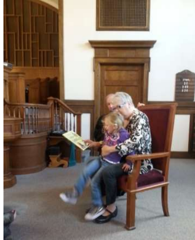
- Some photos of recent Children's time