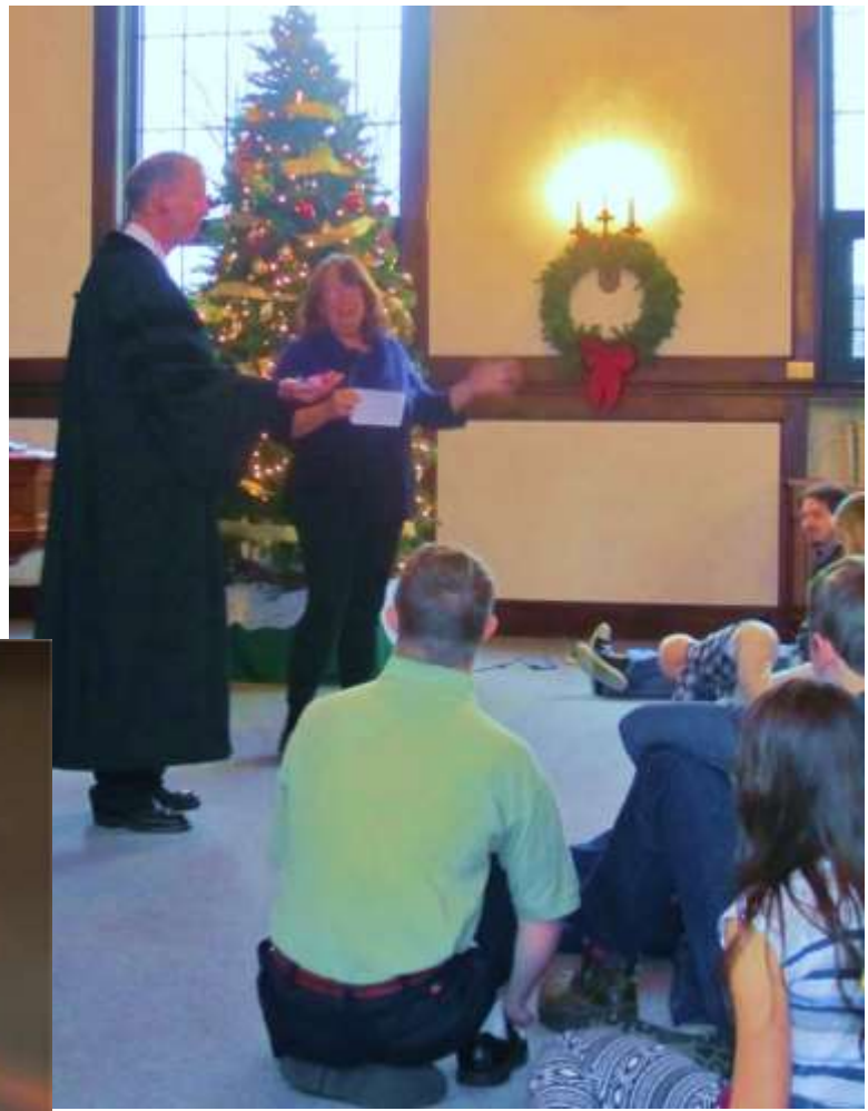
Bottom: Christmas Eve Candlelight service.