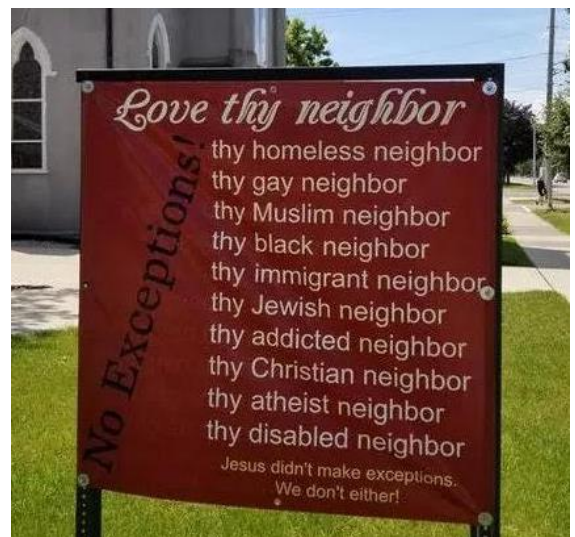
Proposed all-inclusive sign for the church yard.