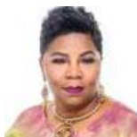
The Rev. Traci Blackmon Associate General Minister Justice and Local Church Ministries